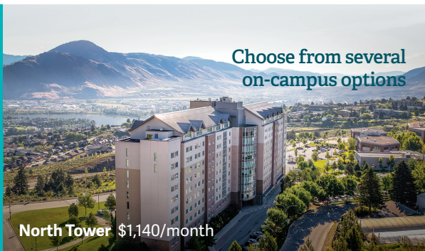
North Tower $1,140/month

TRU offers guaranteed housing for first-year international students who apply early. Living on or near campus is a great way to settle in, make friends and stay connected to university life.