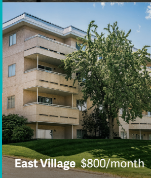
East Village $800/month