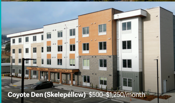
Coyote Den (Skelepéllw) $500–$1,250/month